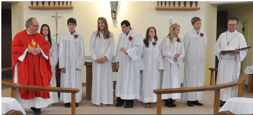
Confirmation Sunday celebrated on October 16th.

Regular classes scheduled for Nov 6, 13 and 20th. November 27th we start rehearsal for our annual play.